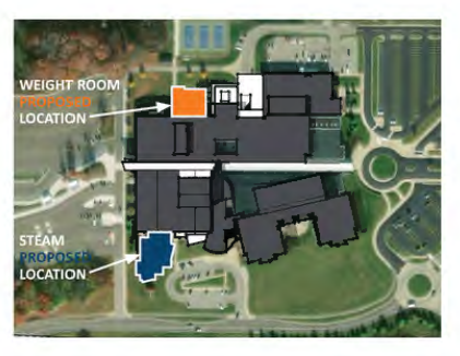
Proposed locations of STEAM Center and weight room additions at Saline High School.