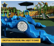
CONCEPTUAL PLAYGROUND, FINAL SUBJECT TO CHANGE