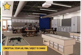
CONCEPTUAL STEAM LAB, FINAL SUBJECT TO CHANGE